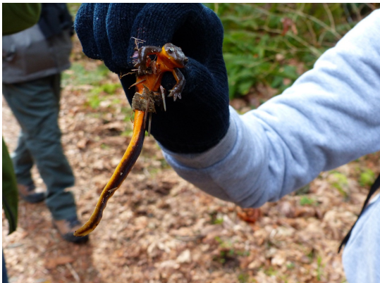
Submitted by Teri Hitch