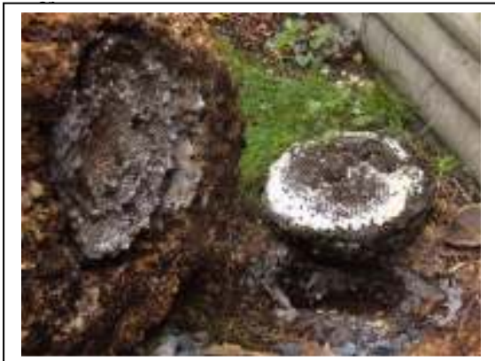
Wood block tipped over; a layer of larvae cells exposed