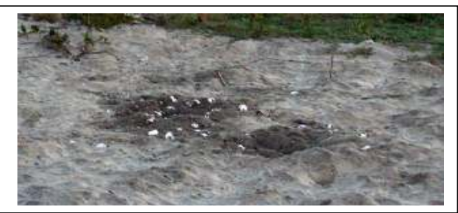
Eggs destroyed by birds, snakes & raccoons.