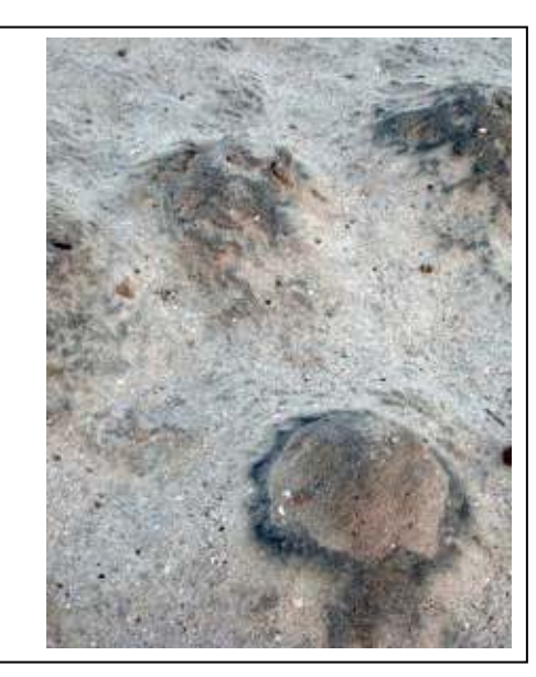
Sand hills containing eggs.

The National Mexican Turtle Center is under the direction of the National Fisheries Institute. For information go to: