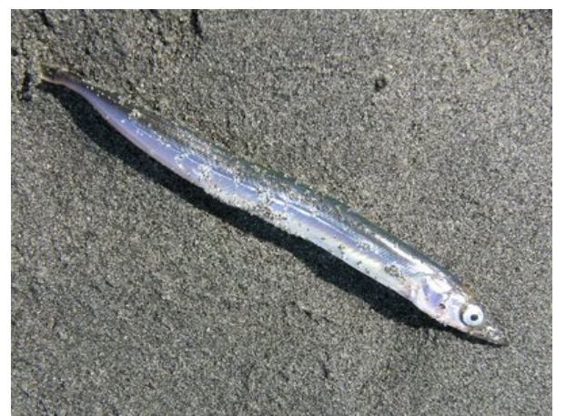
Pacific sand lance

From these little fishes, big things grow. The year round abundance of forage fish determines the