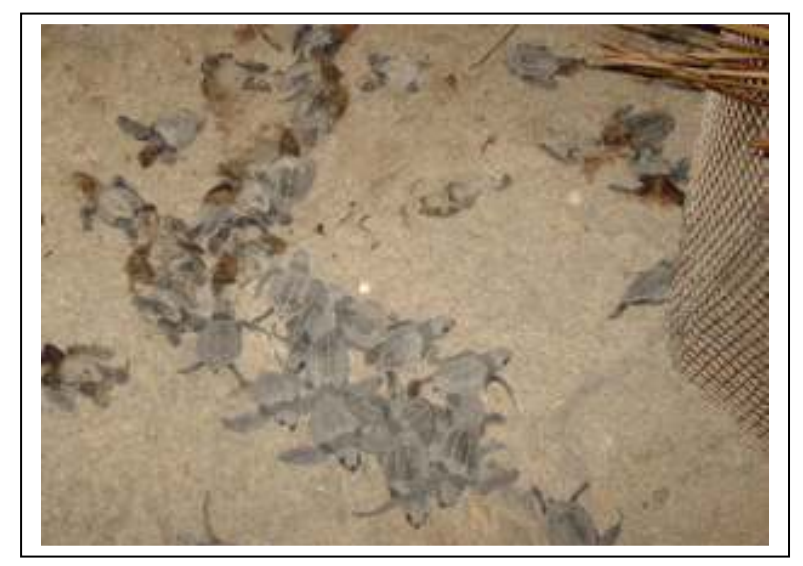
Turtles, Turtles Everywhere